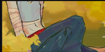
octobermonh day 13 cuz it'd be weir... ajax_the_salmon