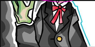
Redead - Oct 20 potuc