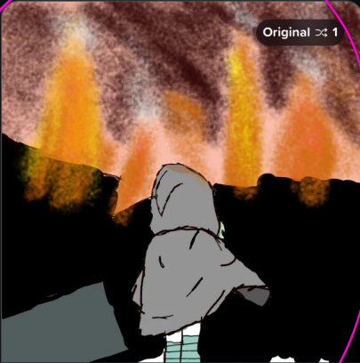
October 16 rxc00n